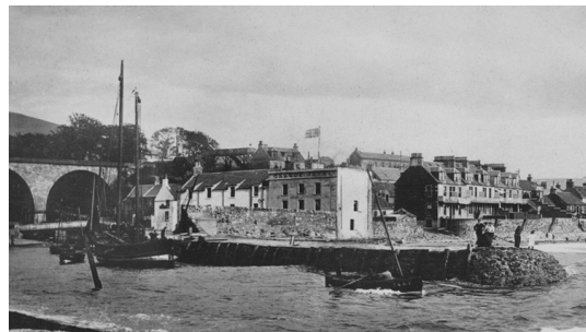
Largo from Lundin Pier

The Crusoe Hotel has been put on the market and we expect the sale to be completed quite quickly, probably before Christmas. The Crusoe Hotel owns Largo Pier and the car park, and the property will be sold complete.